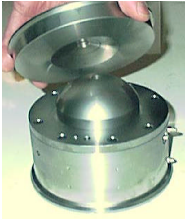
Dynamic Angle Validator 2